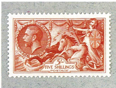
The famous Seahorse design

In addition to the 20p special definitive, the sheet includes a reproduction, without lower corner letters, of the Penny Black itself and has as the background a detail from the famous Seahorse design of 1913. The Seahorse design was used on the George V 2s 6d, 5s, 10s and £1 High Values — Britain's first pictorial stamps.